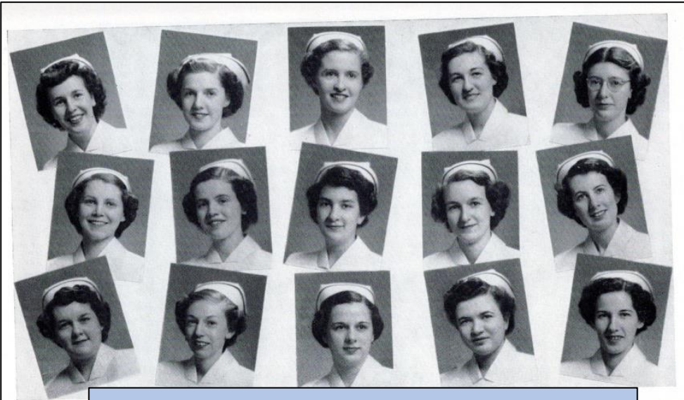
JANUARY GRADUATING CLASS OF 1950