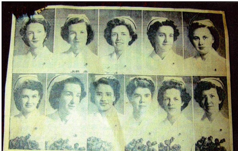
PRIZE WINNERS 1950