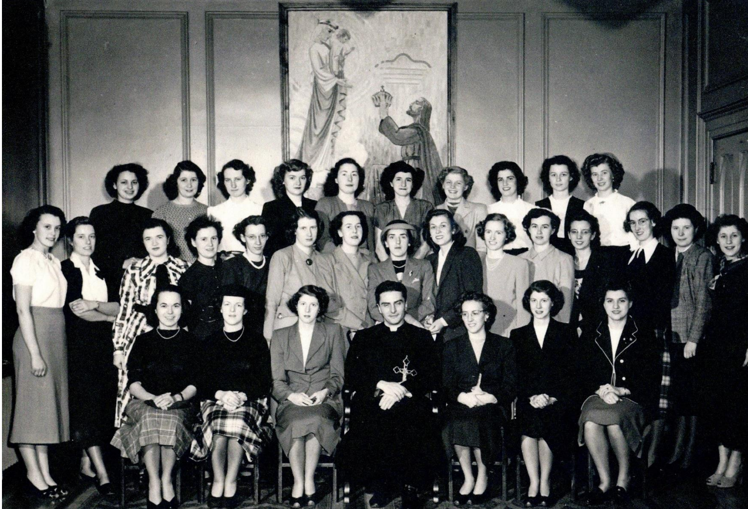
1950 Retreat at Mt. Cevacle Hamilton Ont. Students from classes of '46, '47, '48, '49, '50, '51