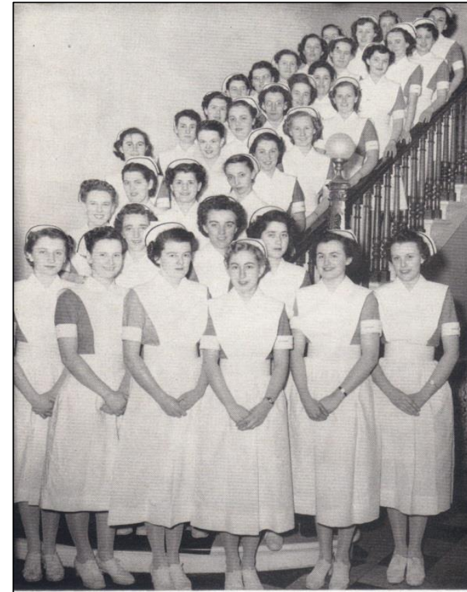
SEPTEMBER GRADUATING CLASS OF 1950